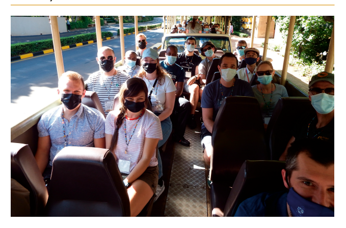
FUSION 2021 attendees on the Game Drive.

required to host either format. The success of this event can be attributed to the continued support of a vibrant information community.