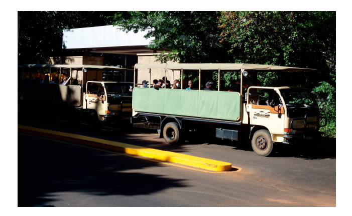
FUSION 2021 attendees on the Game Drive.